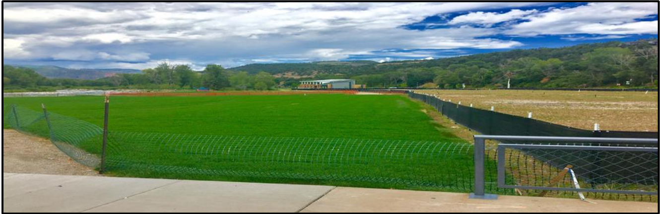
Green side is public park. Black fence delineates privately owned property.